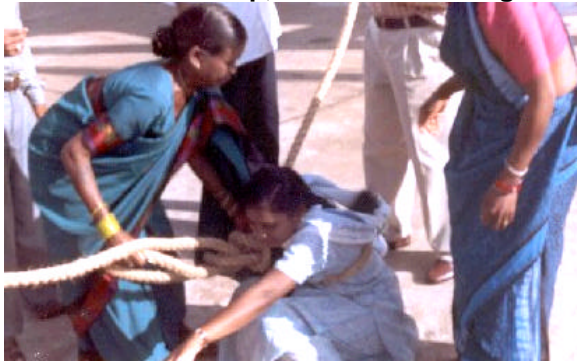
Exercise on Search and Rescue