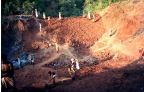
Hatigada Village, Bandhugaon Block