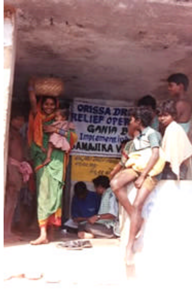
Rajingi Food Distribution