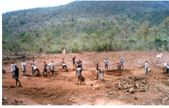
Water Harvesting Structure at Debanikhola of Khandapara Block