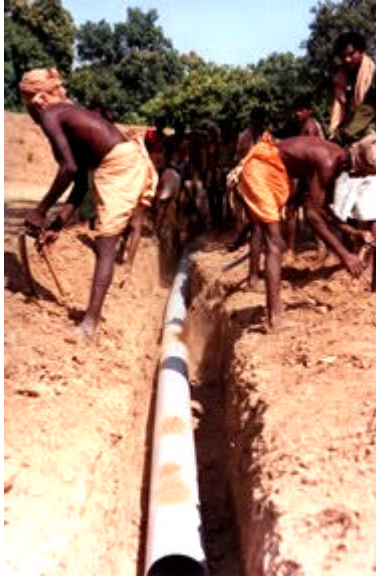
Paturia Lift Irrigation,