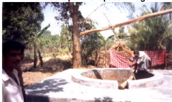
New Dug well (For drinking water), Bankiharijan Sahi, Khamakhyanagar