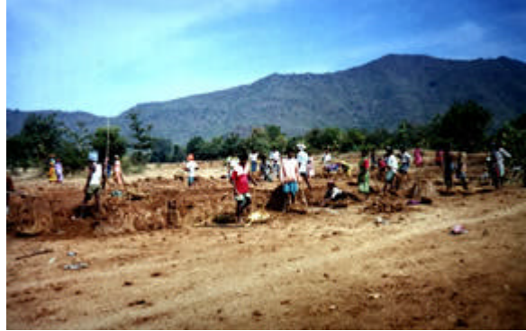
Gadebandha Village, Nanla Block