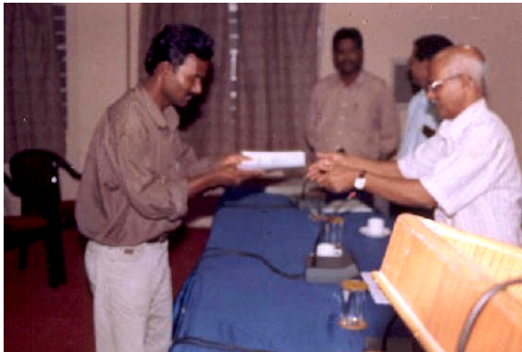
Certificate Distribution to Participants