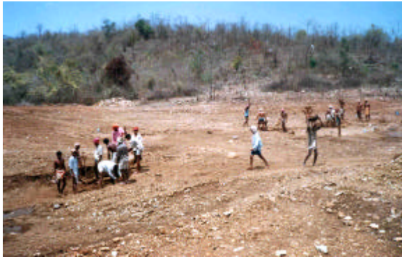
Water Harvesting Structure at Dabanikhola of Khandapara Block