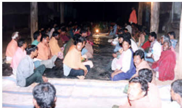
Rajingi Village Meeting