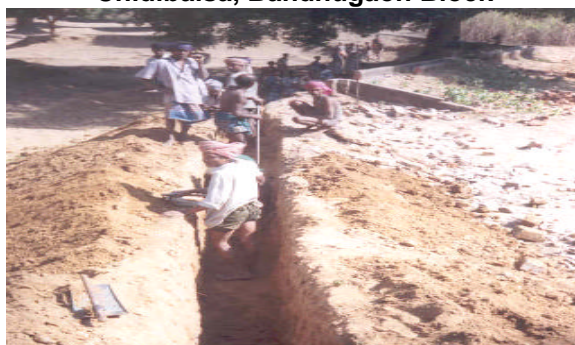
Canal Digging at Paturia Village