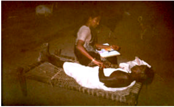
Health Check up, Kesobhadra Village