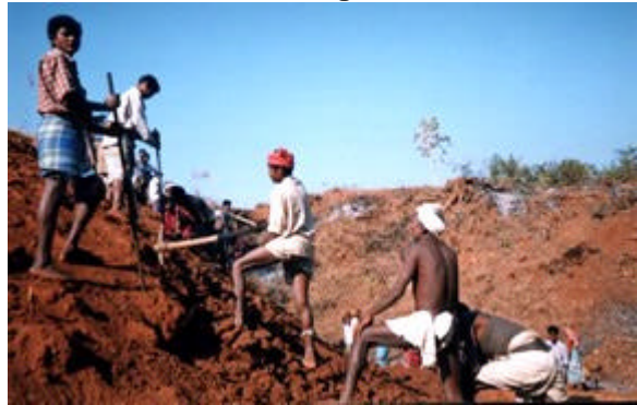
Hatigada, Bandhubaon Block