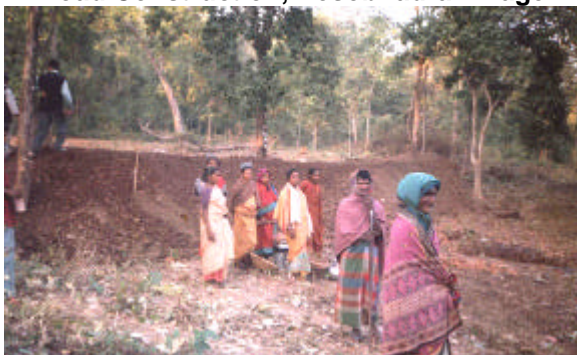
A checkdam being constructed by beneficiaries under FFW at Notto Village