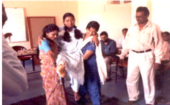
Exercise on Search and Rescue