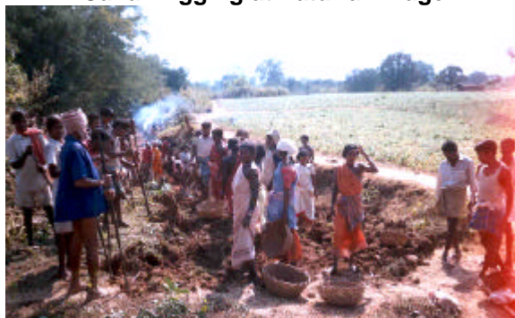
Road work at Kesobhadra Village