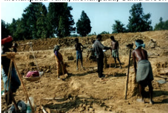
Barakotia, Pallahara Block