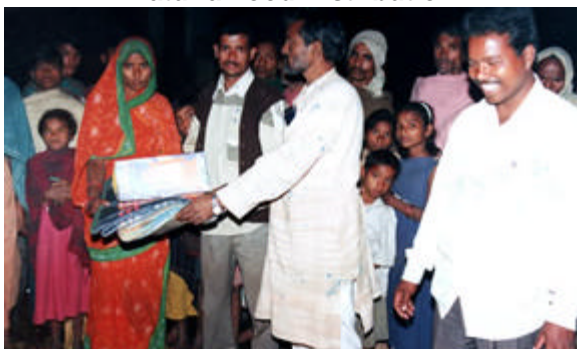
Shelter Material Distribution, Kaliapada