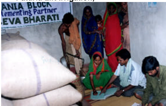
Paturia Food Distribution