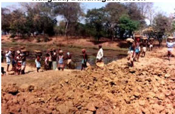
Khalidevo Tank, Pandrasinga, Gania