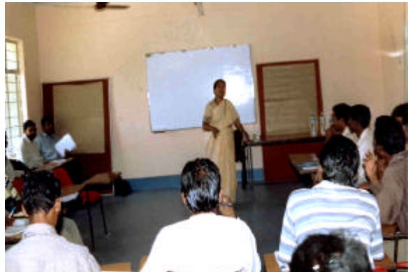
Facilitation on Community Health and Sanitation