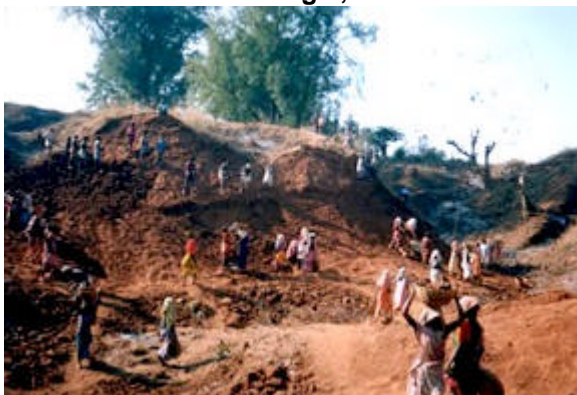
Hatigada, Bandhugaon Block