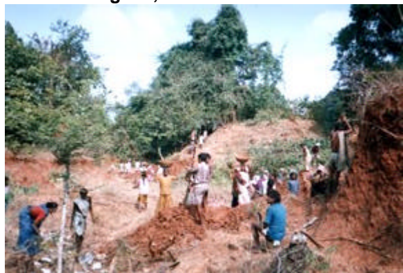
Hatigada, Bandhugaon Block