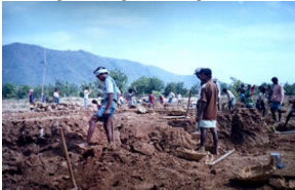
Gadebandha Village, Nanla Block