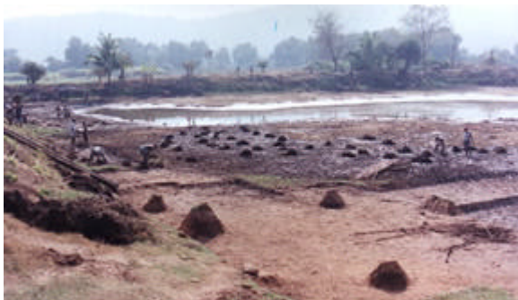
Mohanpada Tank, Mohanpada, Gania Block