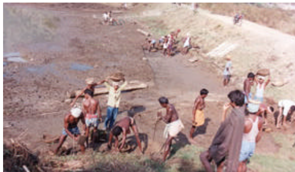
Raijing Tank, Rajingi Village, Gania Block