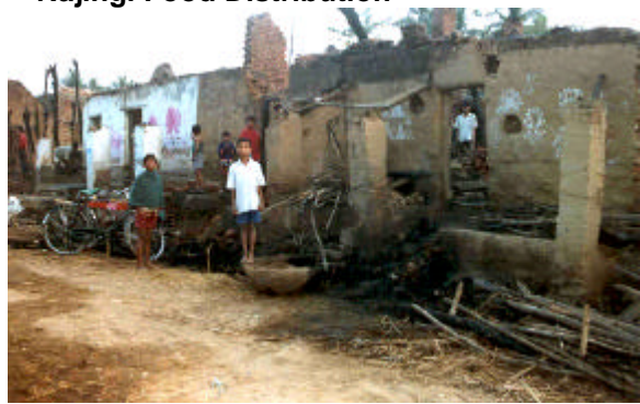
Fire Breakup in Kaliapada Village